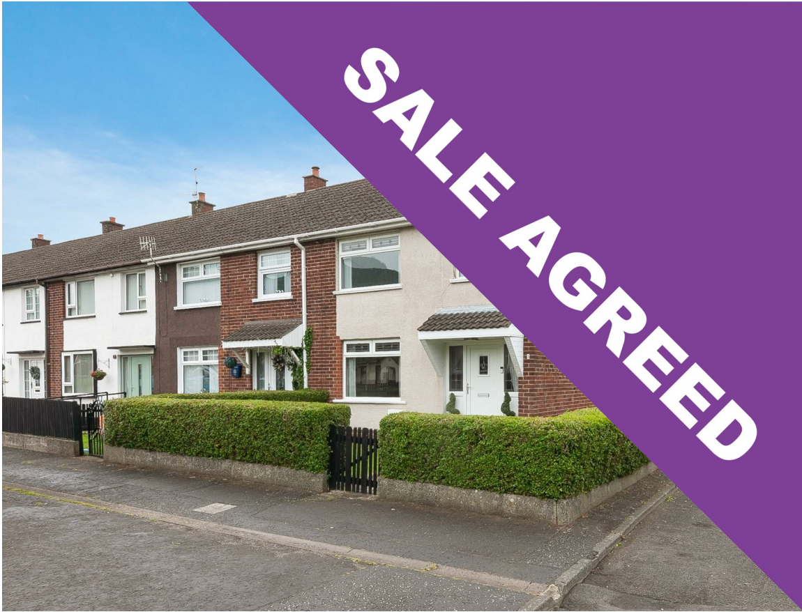
3 Glanroy Crescent, Newtownabbey, BT37 9JZ